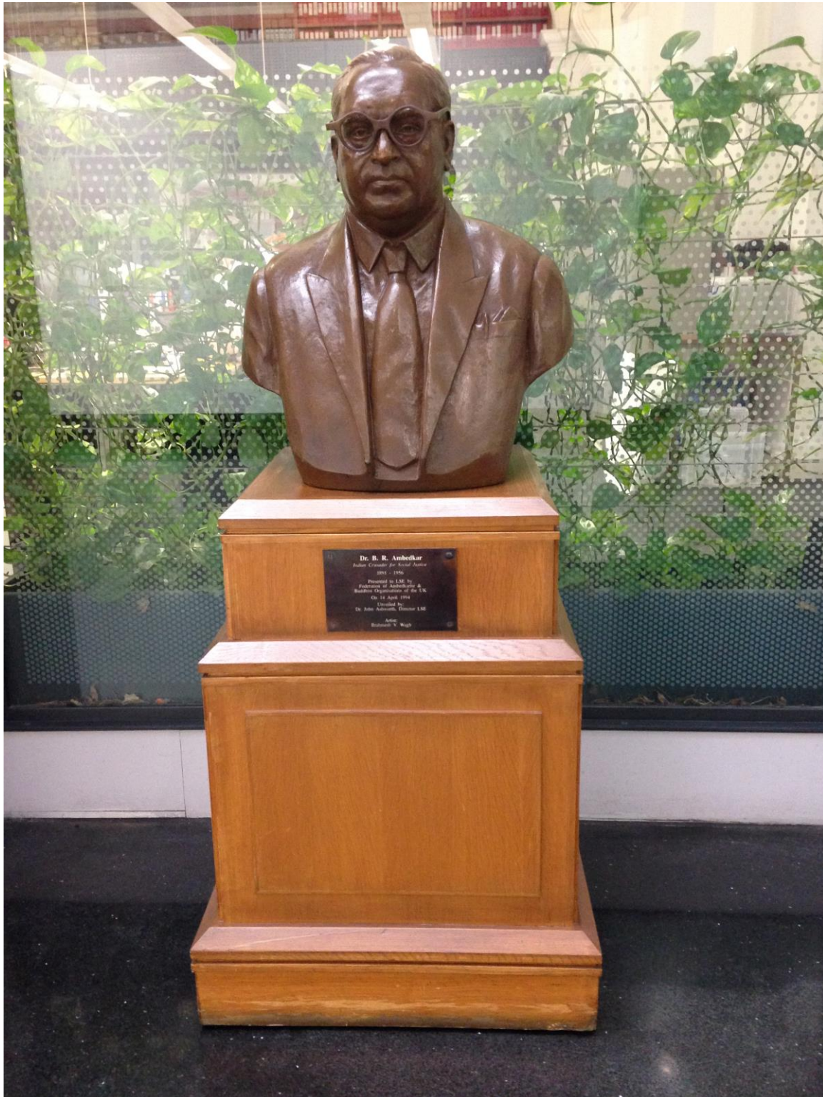
Dr. B. R. Ambedkar First Indian Political Leader with Formal Training in Economics